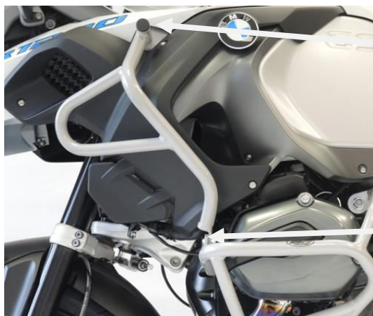
Bolt M8x40 Washer M8 Plastic cap