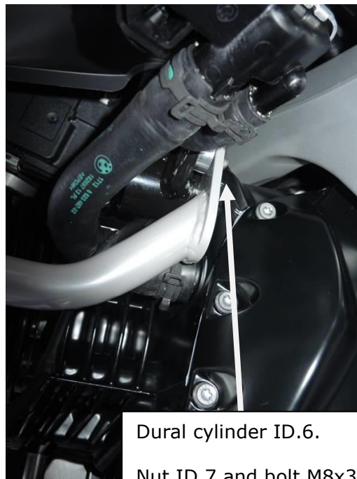
Dural cylinder ID.6.